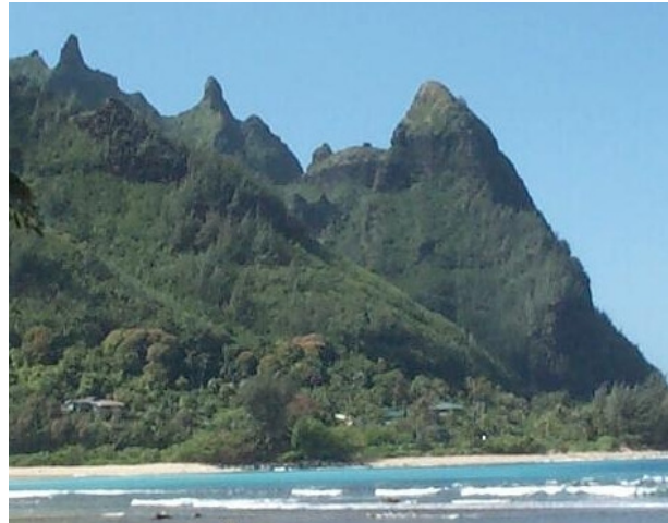
Ke'e Beach on the North Shore