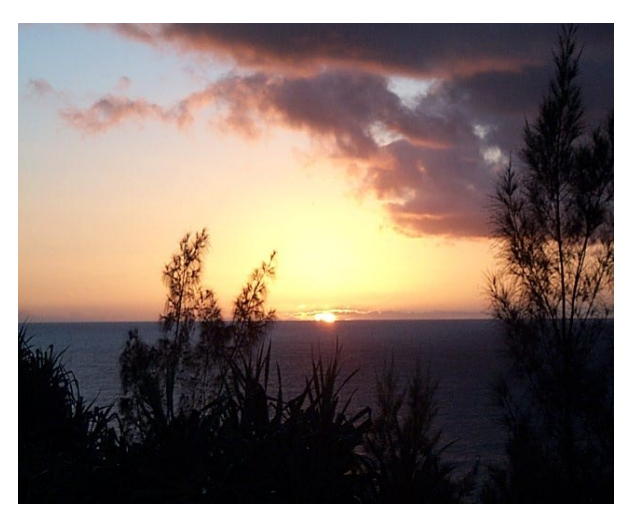
Ocean Sunset from The Cliffs at Princeville