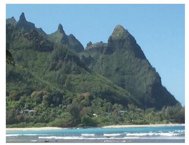
Ke'e Beach on the North Shore